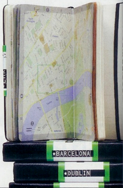
Moleskine's new City Notebooks for Europe.