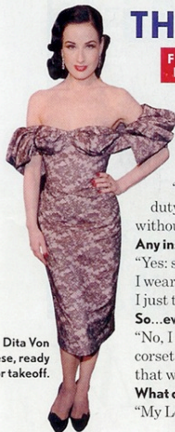
Dita Von Teese, ready for takeoff.