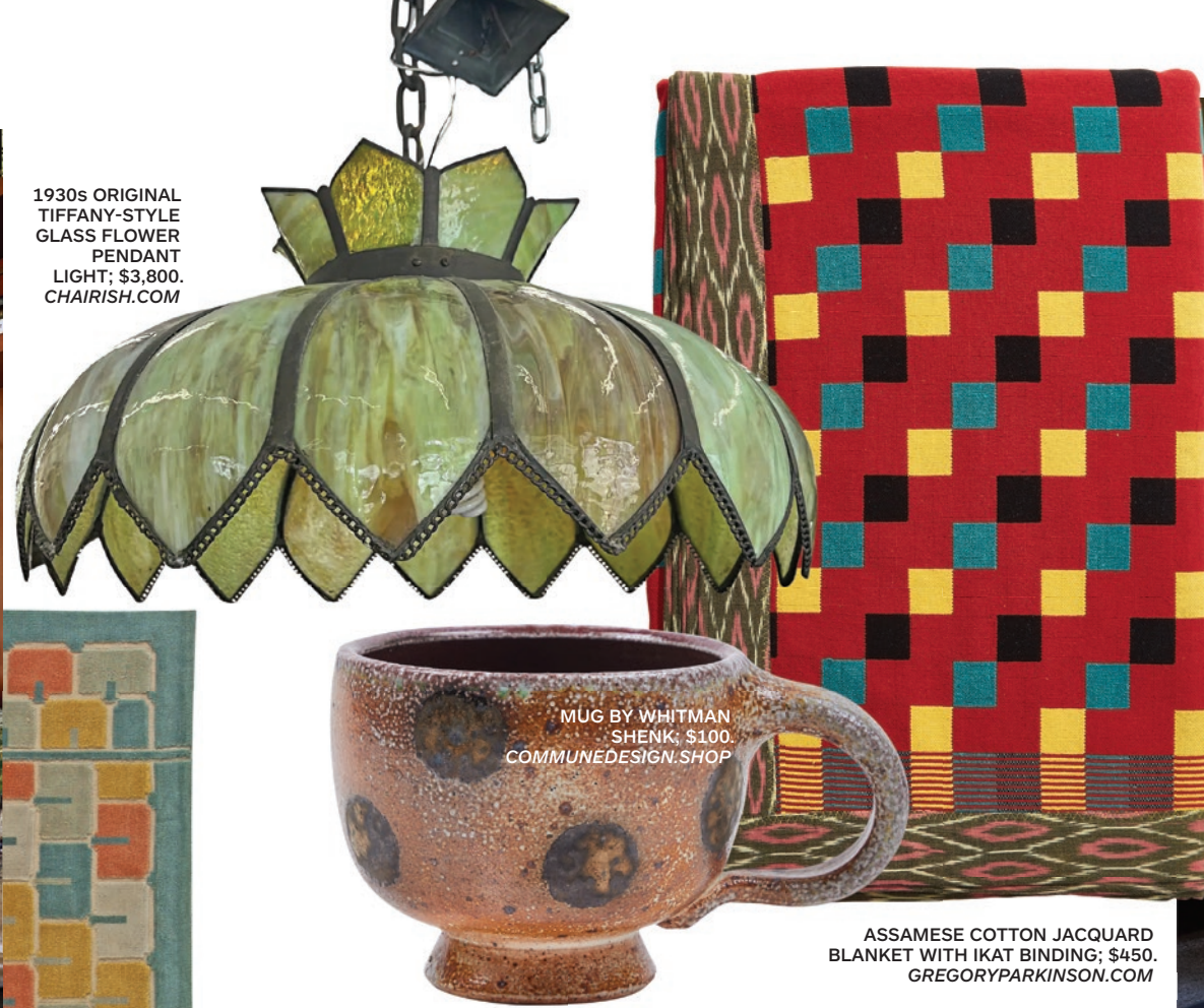
MUG BY WHITMAN SHENK; $100. COMMUNEDESIGN.SHOP