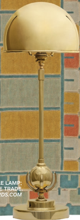
CLAW TABLE LAMP; TO THE TRADE. CHARLESEDWARDS.COM

“Scandinavian summerhouses were a big influence.”