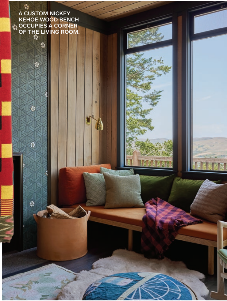
A CUSTOM NICKEY KEHOE WOOD BENCH OCCUPIES A CORNER OF THE LIVING ROOM.