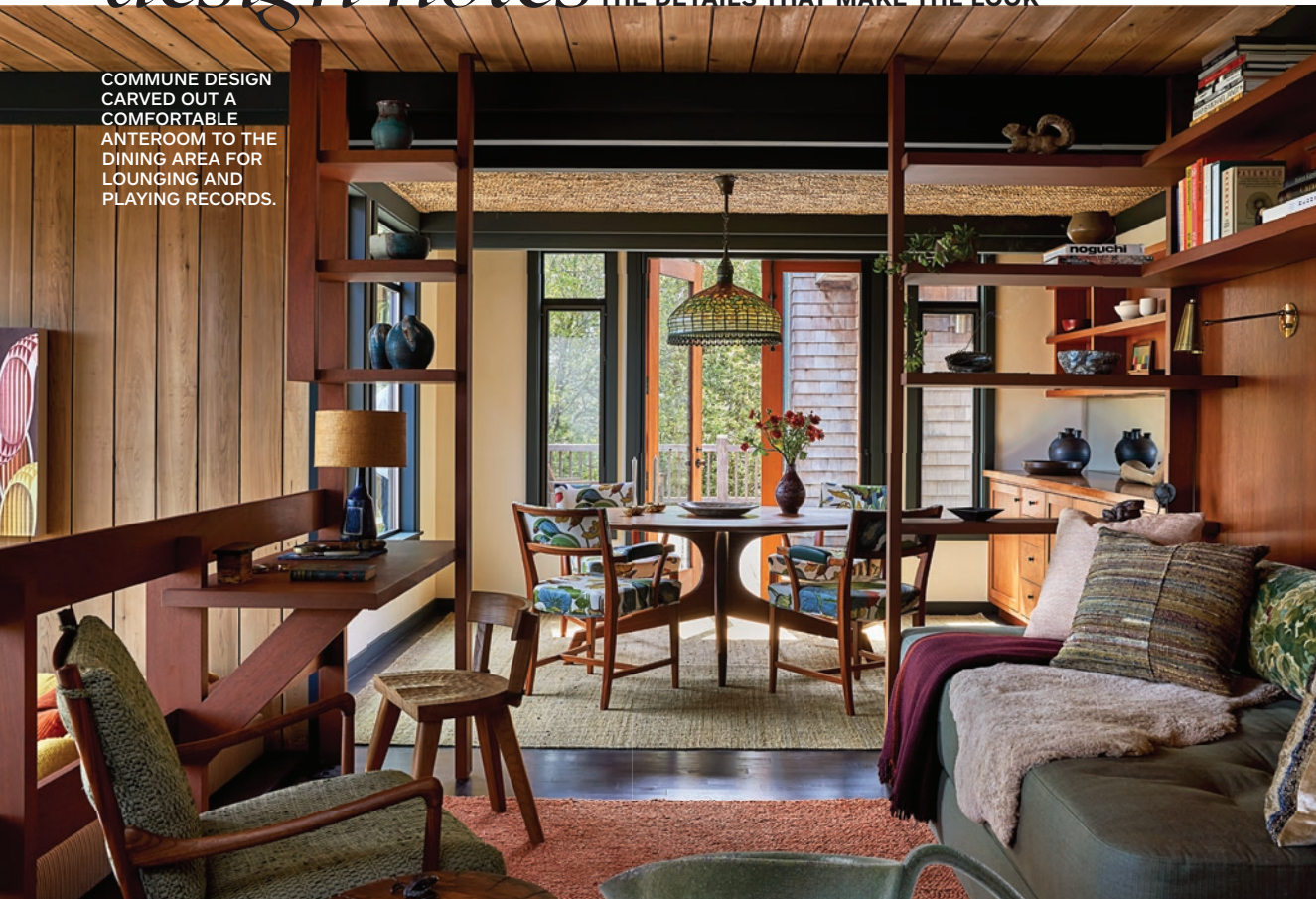
COMMUNE DESIGN CARVED OUT A COMFORTABLE ANTEROOM TO THE DINING AREA FOR LOUNGING AND PLAYING RECORDS.