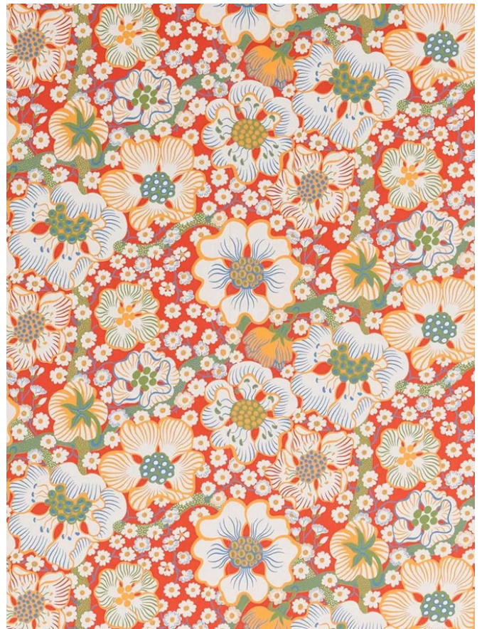
Eldblomman Wallpaper by Josef Frank for Svenskt Tenn