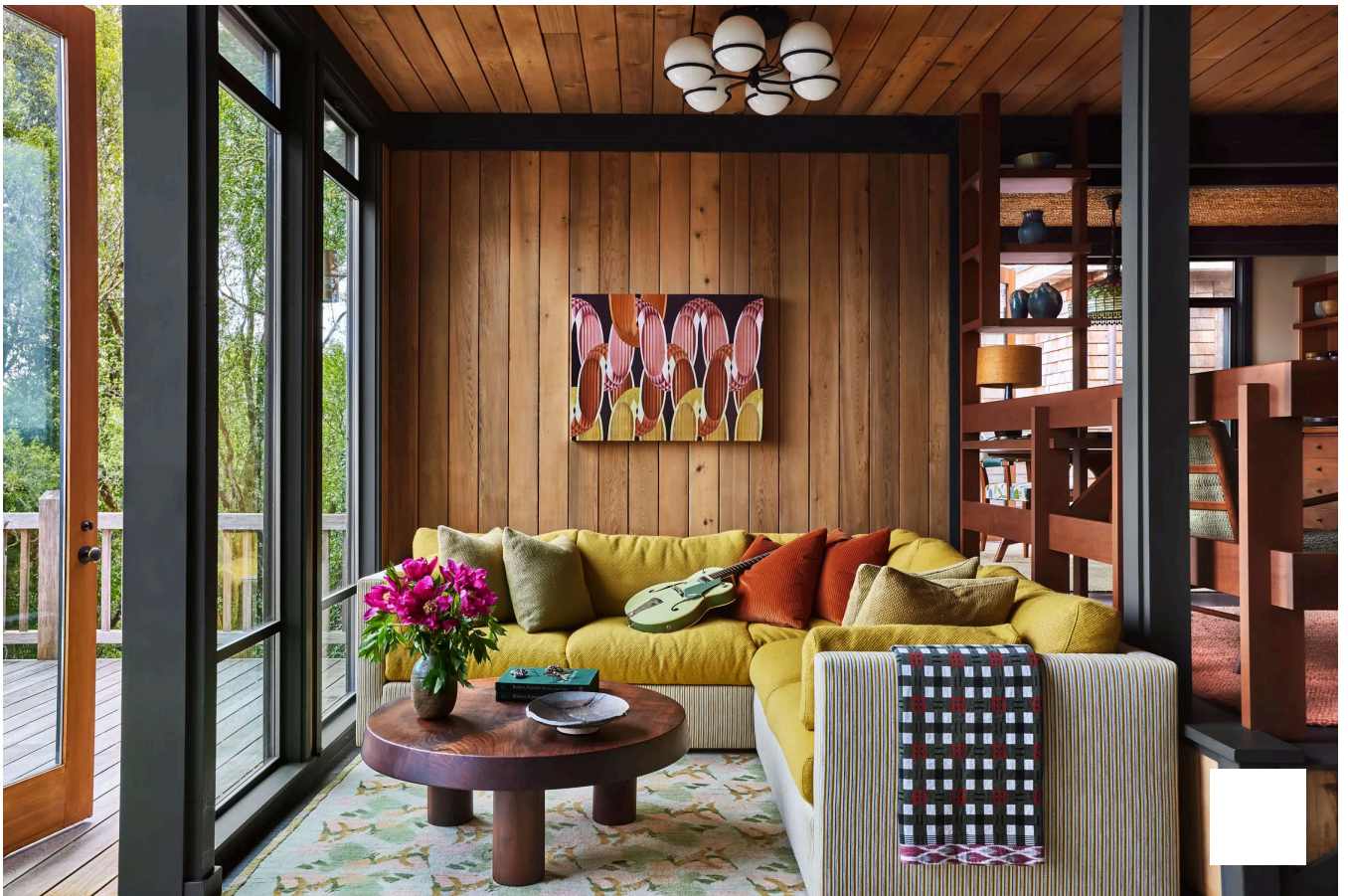
Art: Gianluca Franzese