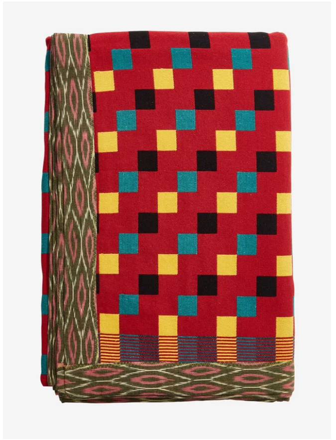
Assamese Cotton Jacquard Blanket With Ikat Binding