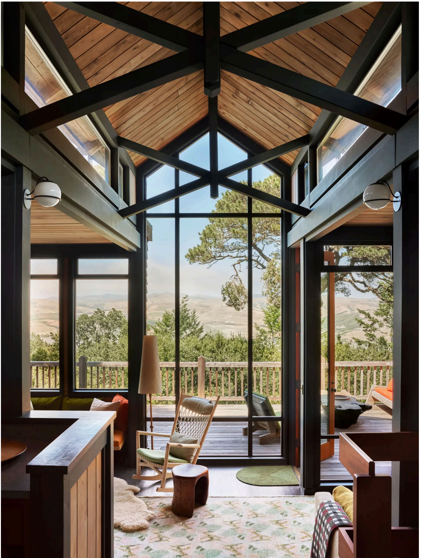
The view from the entry looks through the house and out to the West Marin landscape.