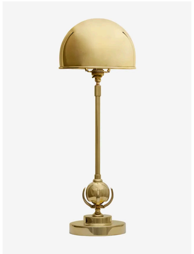
Claw Table Lamp