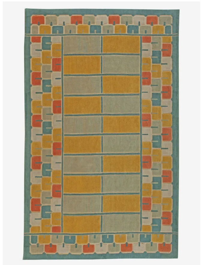
Half Pile Swedish Rug by Doris Leslie Blau