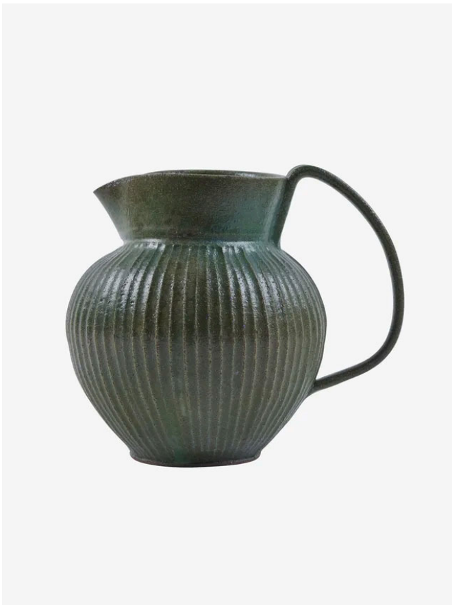
Fluted Pitcher by Zoe Dering