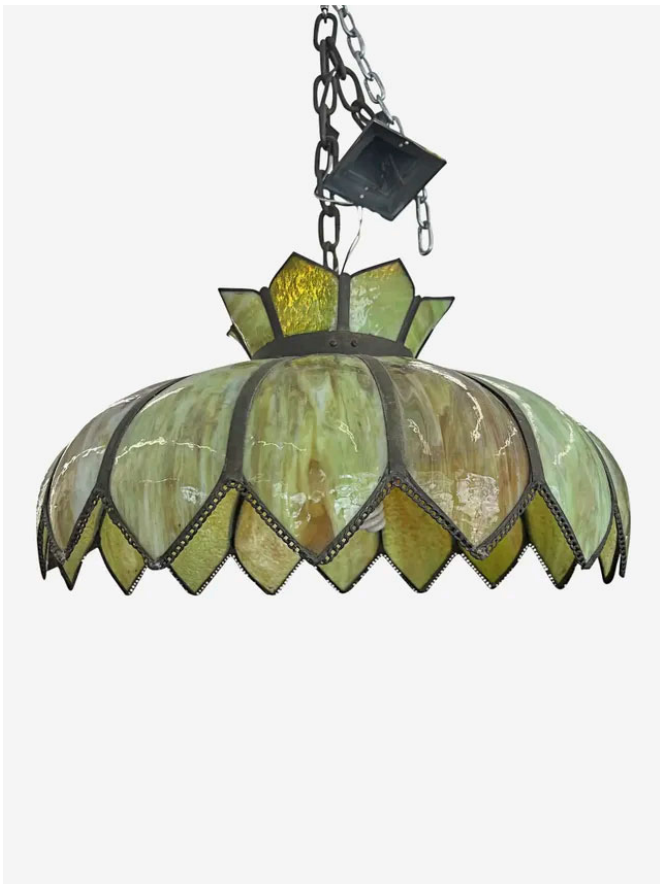
1930s Original Tiffany-Style Glass Flower Pendant Light