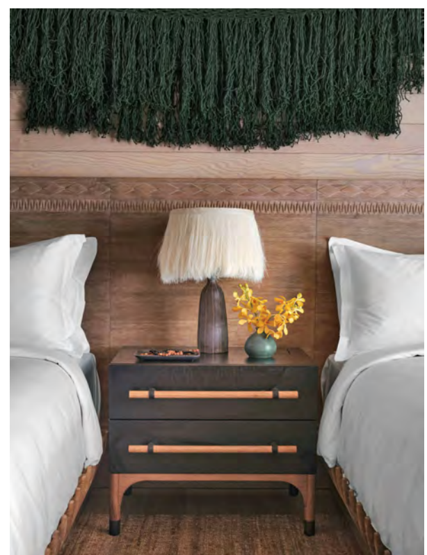
Queen suites have custom oak headboards.

The design of the 150 guest structures depends on where they sit on the site. Yellow and blue tones define those by the ocean; the north village, built over lava flow, has a red-and-black palette. Furnishings include oak beds inspired by the shape of a boat, rugs with Hawaiian motifs, and dark concrete bathtubs that echo the rugged volcanic landscape outside.