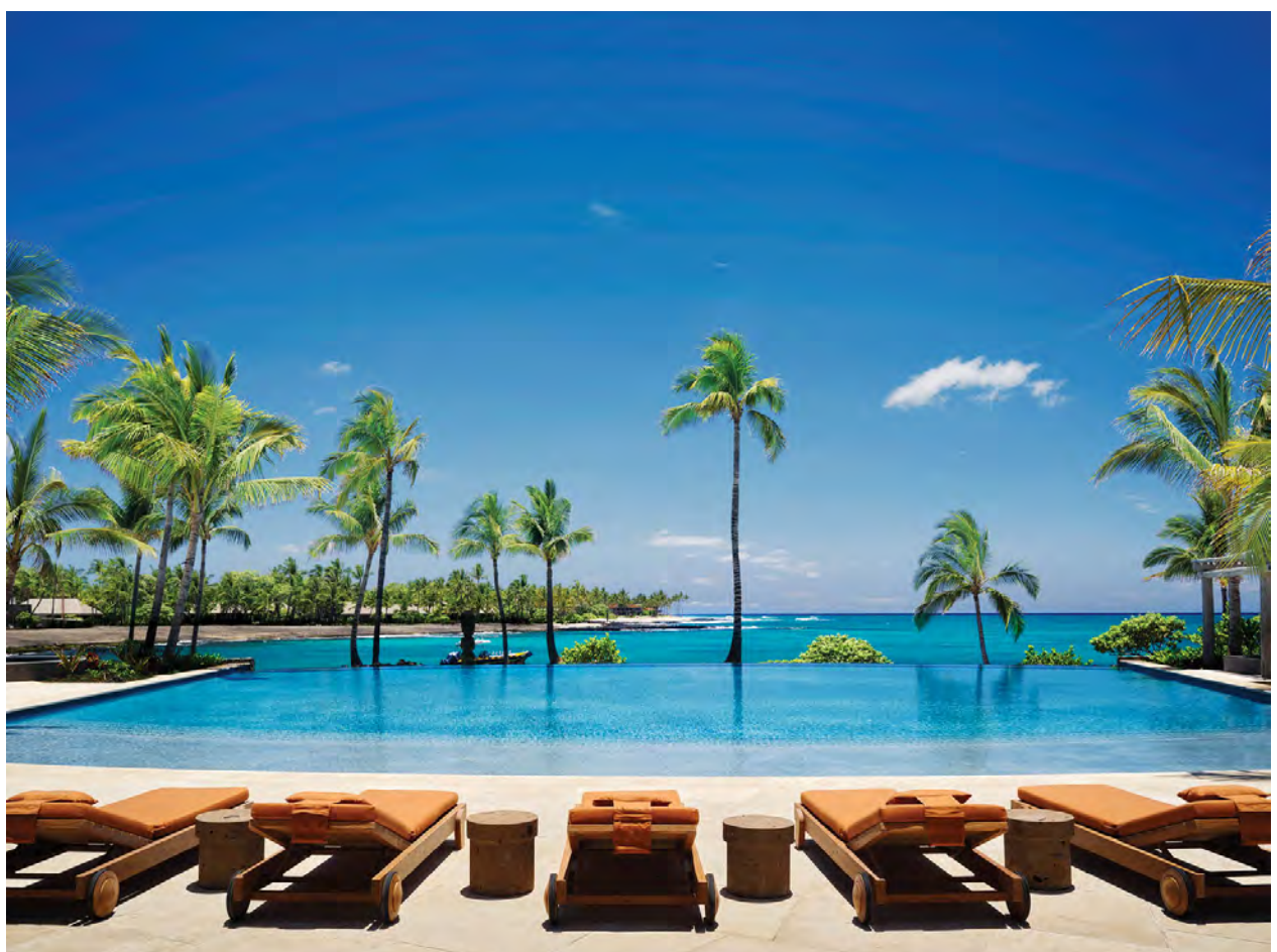
The pool overlooks Kahuwai Bay.