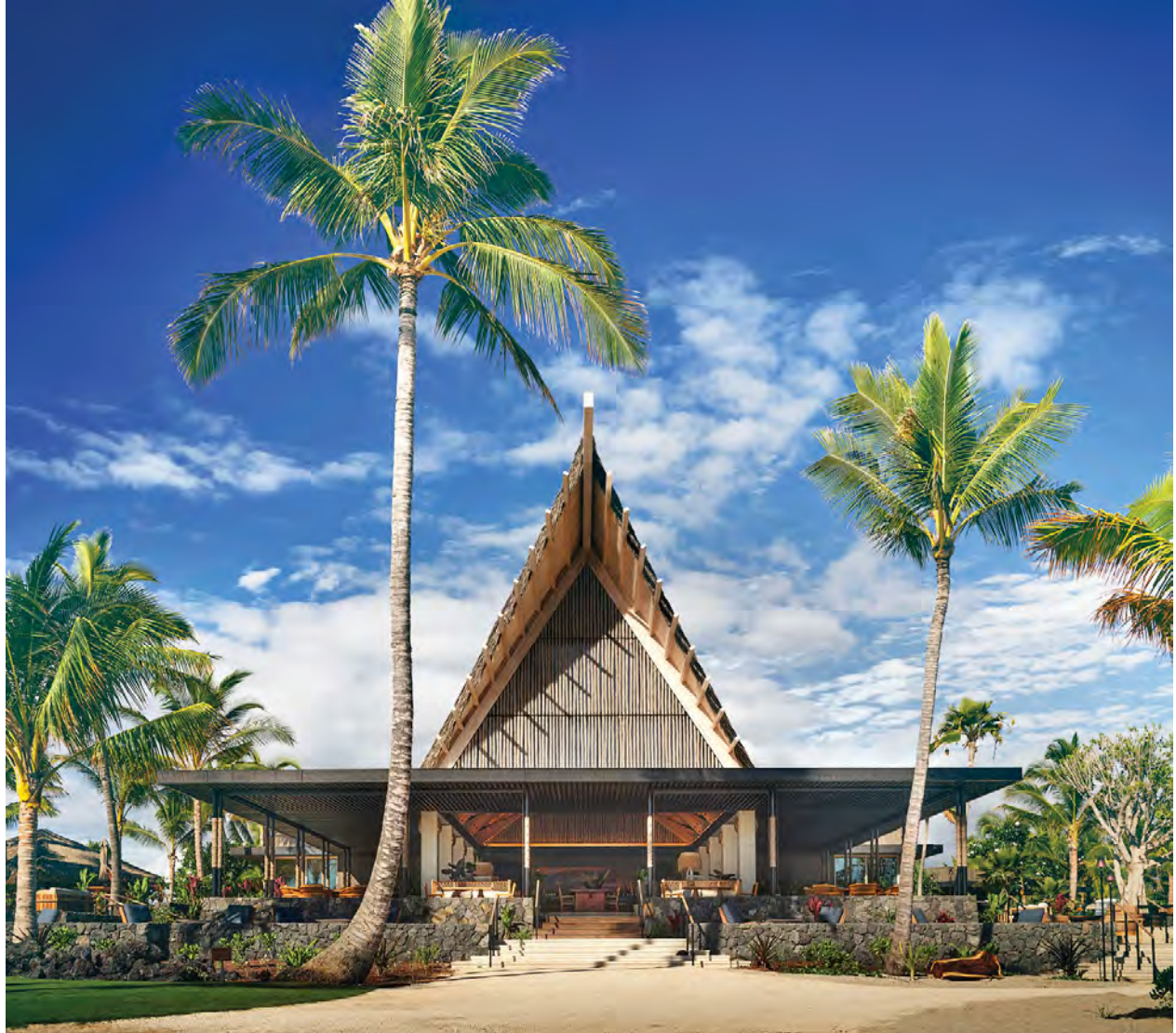
Aged red cedar clads the exterior of the main restaurant, its profile evoking the Polynesian style of the original resort.