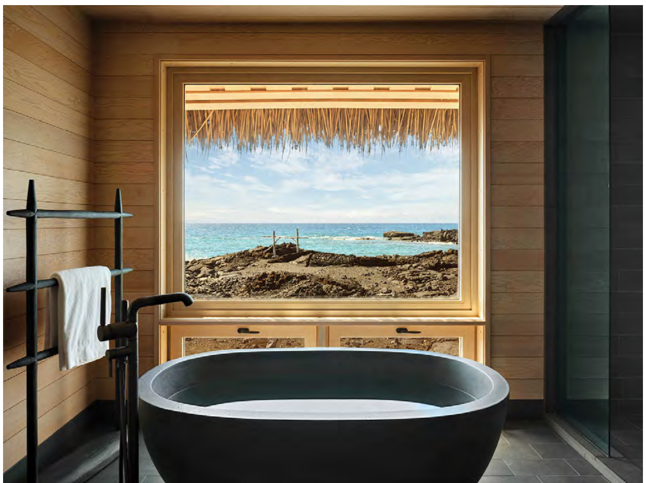
A bathroom's stone tub has a view of a lava field.