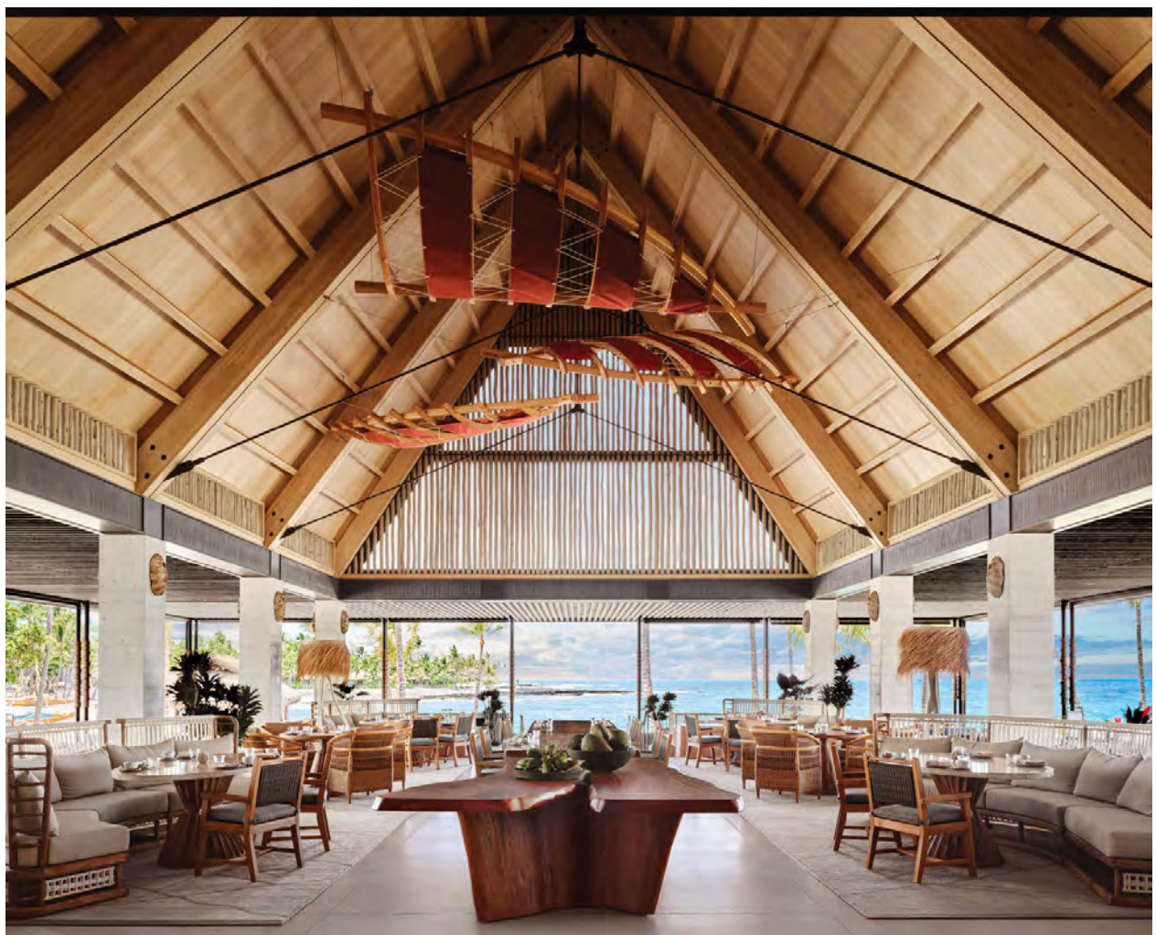
In the main restaurant, an installation of traditional canoe sails by local artist Kaili Chun hangs over a live-edge mahogany table.