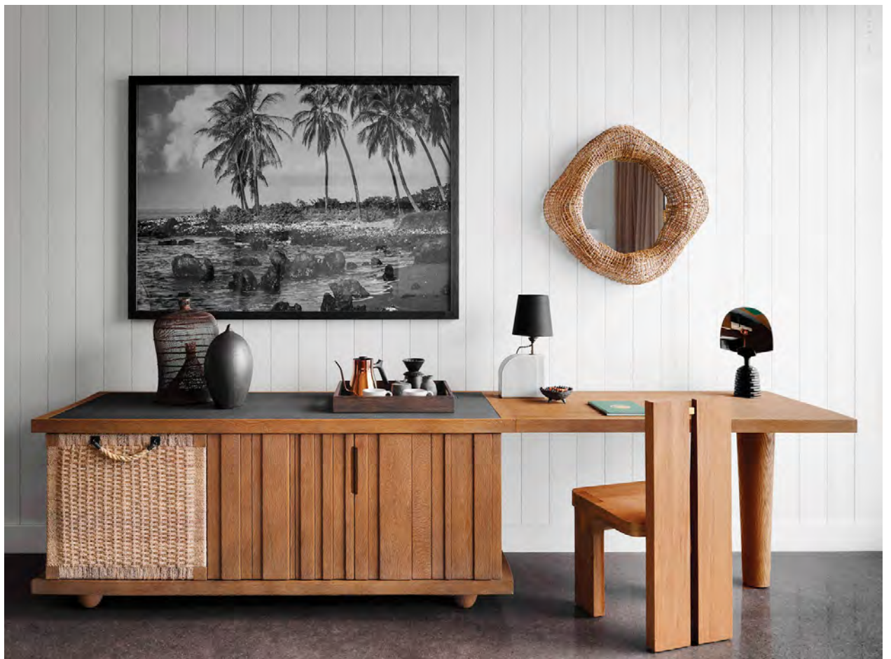
Paul Grace's photograph and a rattan-framed mirror hang in a king suite.