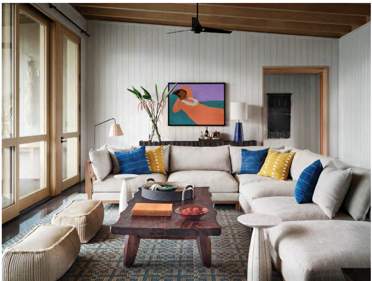
Paola Lenti’s Play ottomans, a custom sofa, and a Pegge Hopper painting furnish a suite living area.