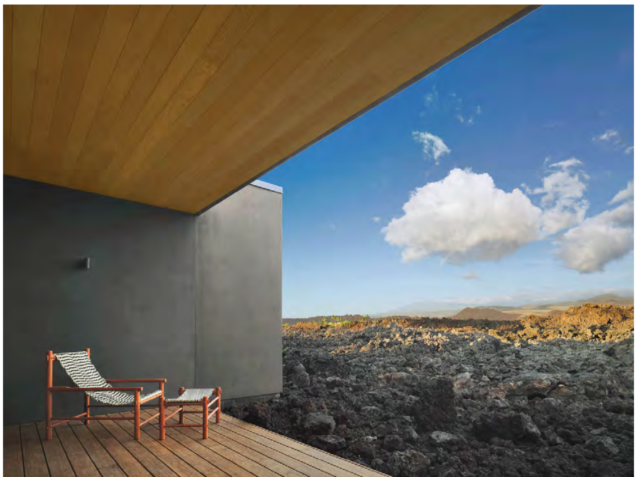
Outside a spa treatment room, an Itz Workshop & Studio chair and footrest overlook a lava field.