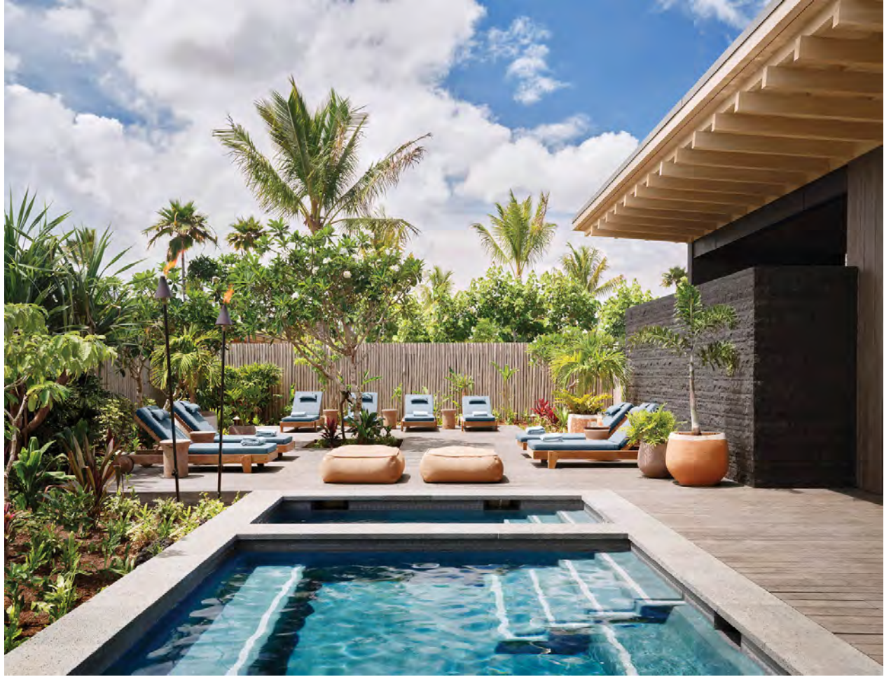
Carlos Motta's Timbó chaise lounges appoint the spa's outdoor hydro circuit.