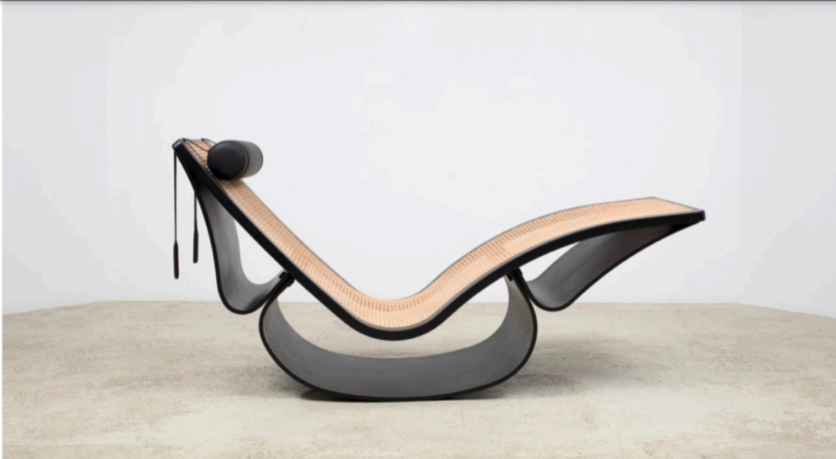
Rio Chaise by Oscar Niemeyer.