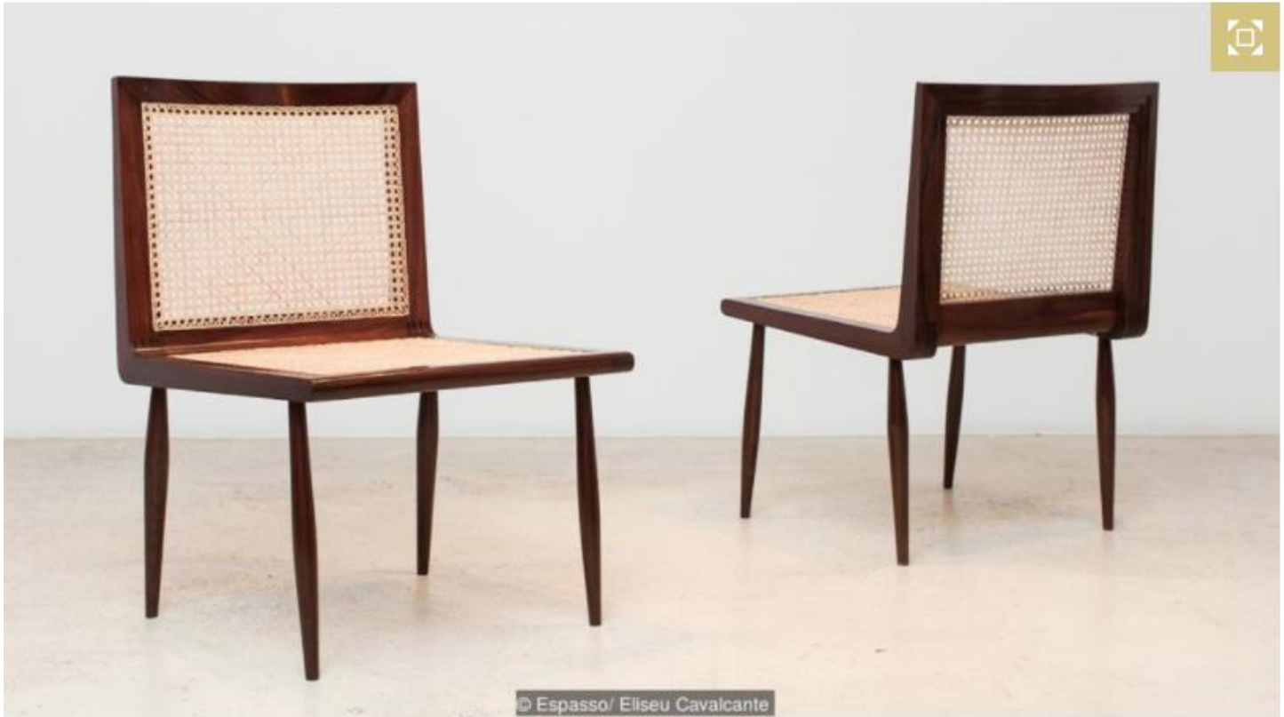
Displayed at Espasso, Miami, are 1950 armchairs, by Joaquim Tenreiro, a pioneer of modernist Brazilian furniture

Embracing colour and idiosyncratic, sculptural forms, mid-century-modern design offered a more relaxed alternative to strictly functionalist early 20th-Century modernism. And, arguably, Latin American furniture is one of the most expressive branches of mid-century design: its chunky, sculptural, often hand-made forms were fashioned from indigenous woods, such as jacaranda (a type of rosewood) in rich, syrupy hues, leather and rattan. And, since the 1980s, younger designers, notably the São Paulo-based Campana Brothers, have upheld this tradition, creating work that prioritizes form over function.