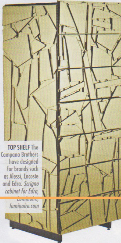
TOP SHELF The Campana Brothers have designed for brands such as Alessi, Lacoste and Edra. Scrigno cabinet for Edra, luminare.com