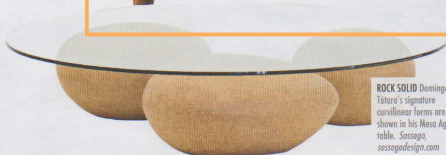
ROCK SOLID Domingos Tótora's signature curvilinear forms are shown in his Mesa Agua table. Sassego, sassegodesign.com