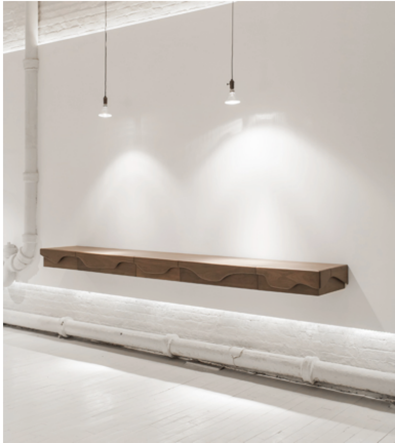
the walnut 'copacabana sideboard' comes in five different sizes