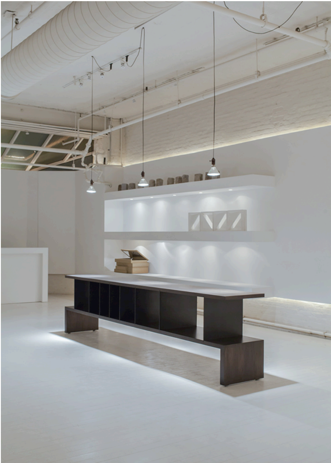
the 'fibonacci bookcase' is crafted from stained american walnut