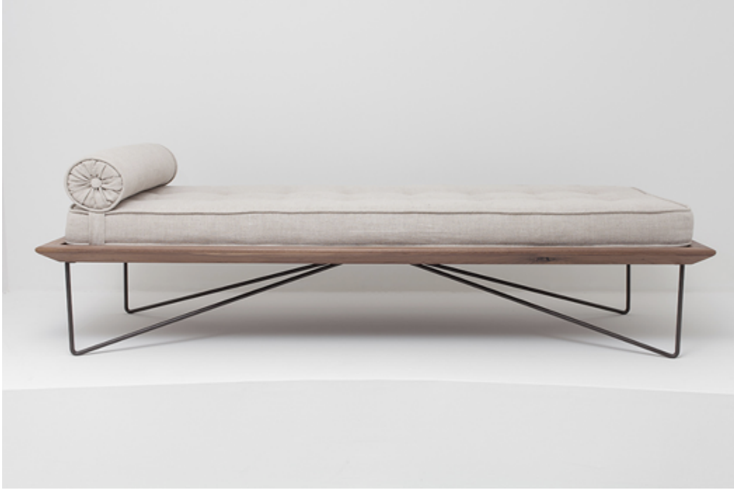
the 'zumbi chaise' was designed by casasa in 2006