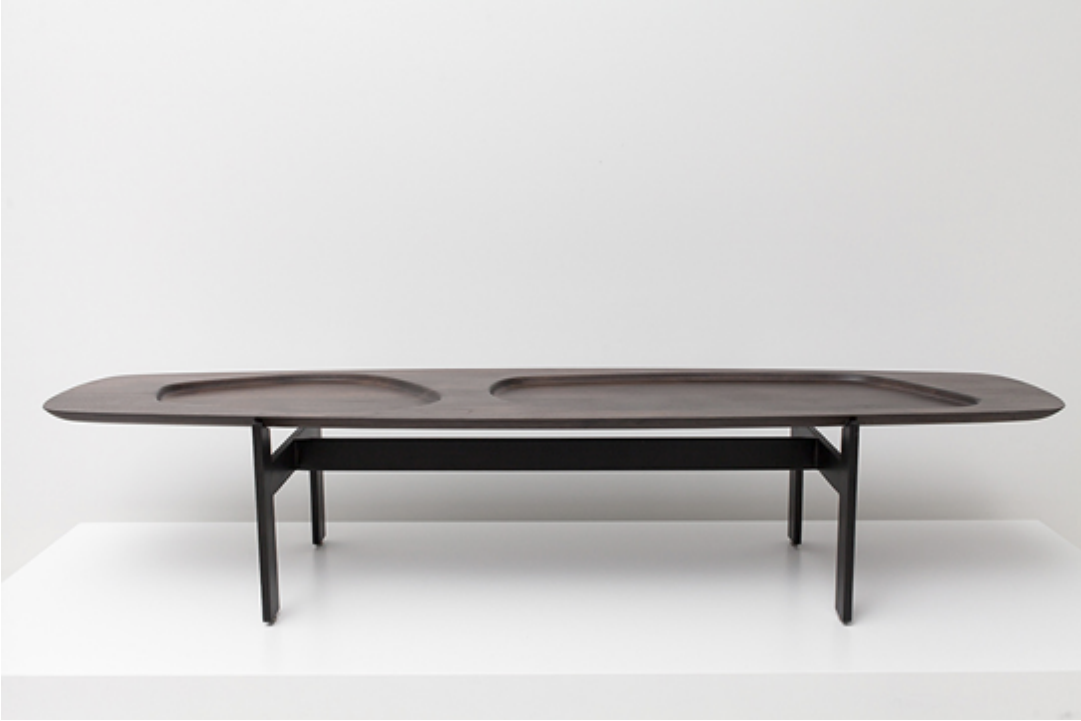
the 'rectangular coffee table' is available in two different widths