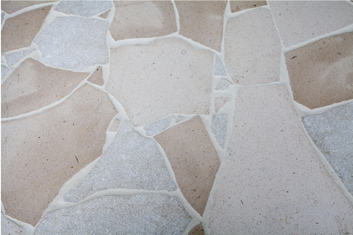
the table's limestone surface

the exhibition coincides with the release of ‘ studio arthur casasa: works 2008-2015 ’ — a new monograph surveying the recent projects of arthur casasa. the book highlights major designs dating from the last seven years through explanatory texts, color photos and rarely-seen drawings.