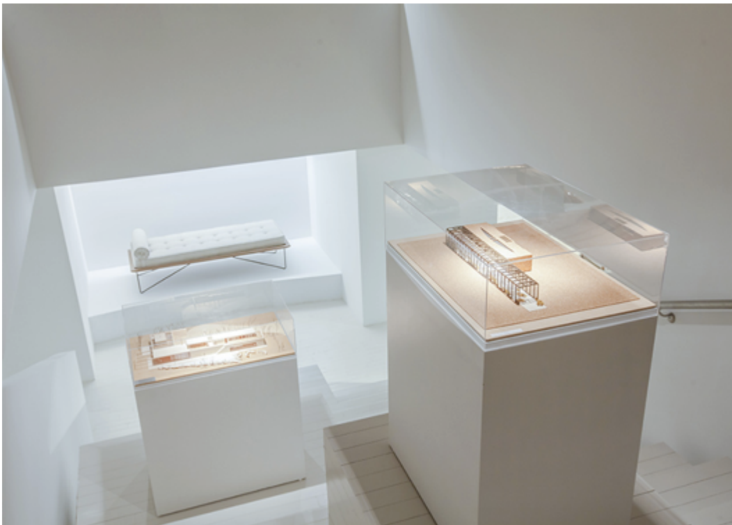
models are presented alongside the items of furniture