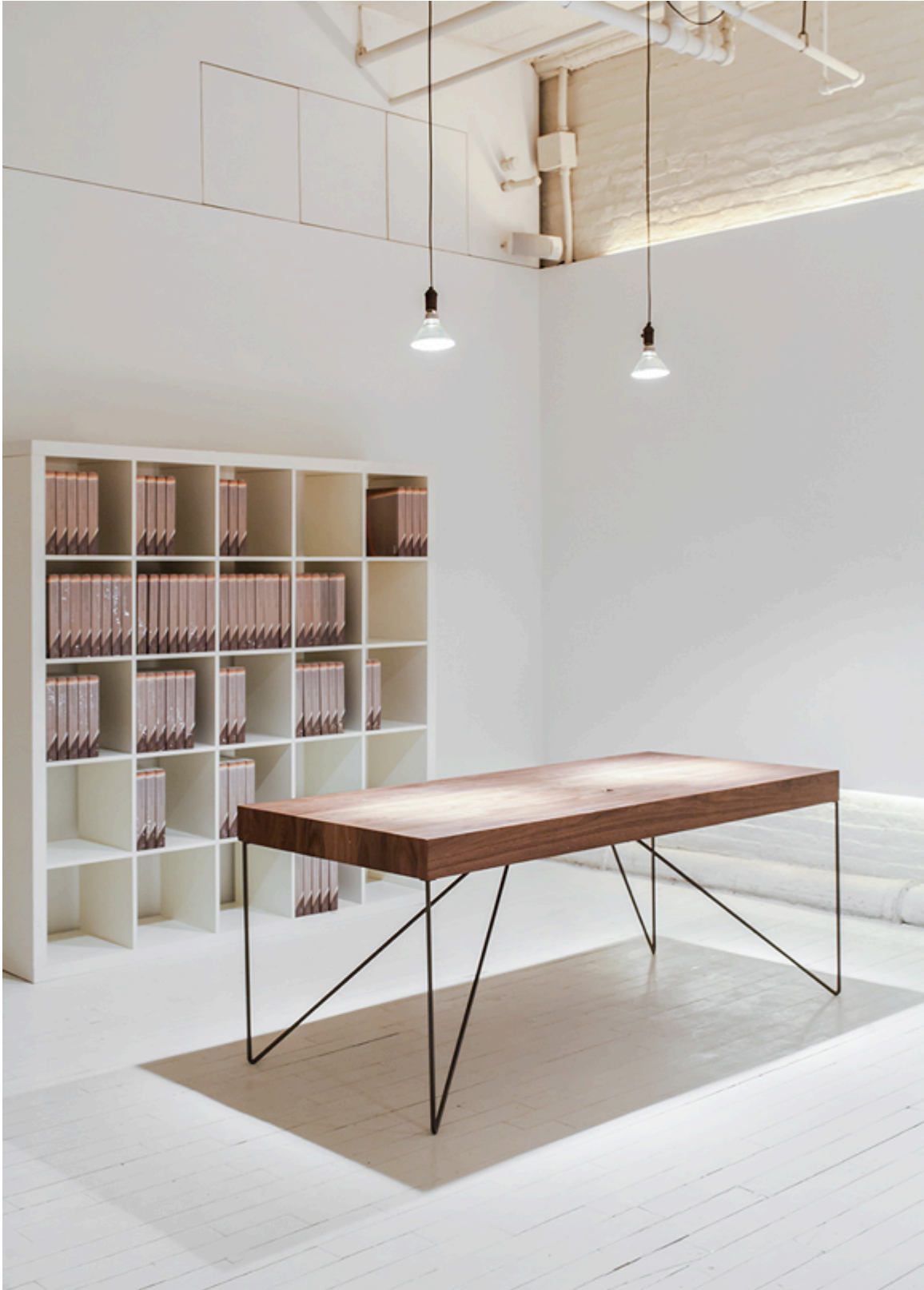
new pieces are joined by previously released works, such as the 'quilombo desk'