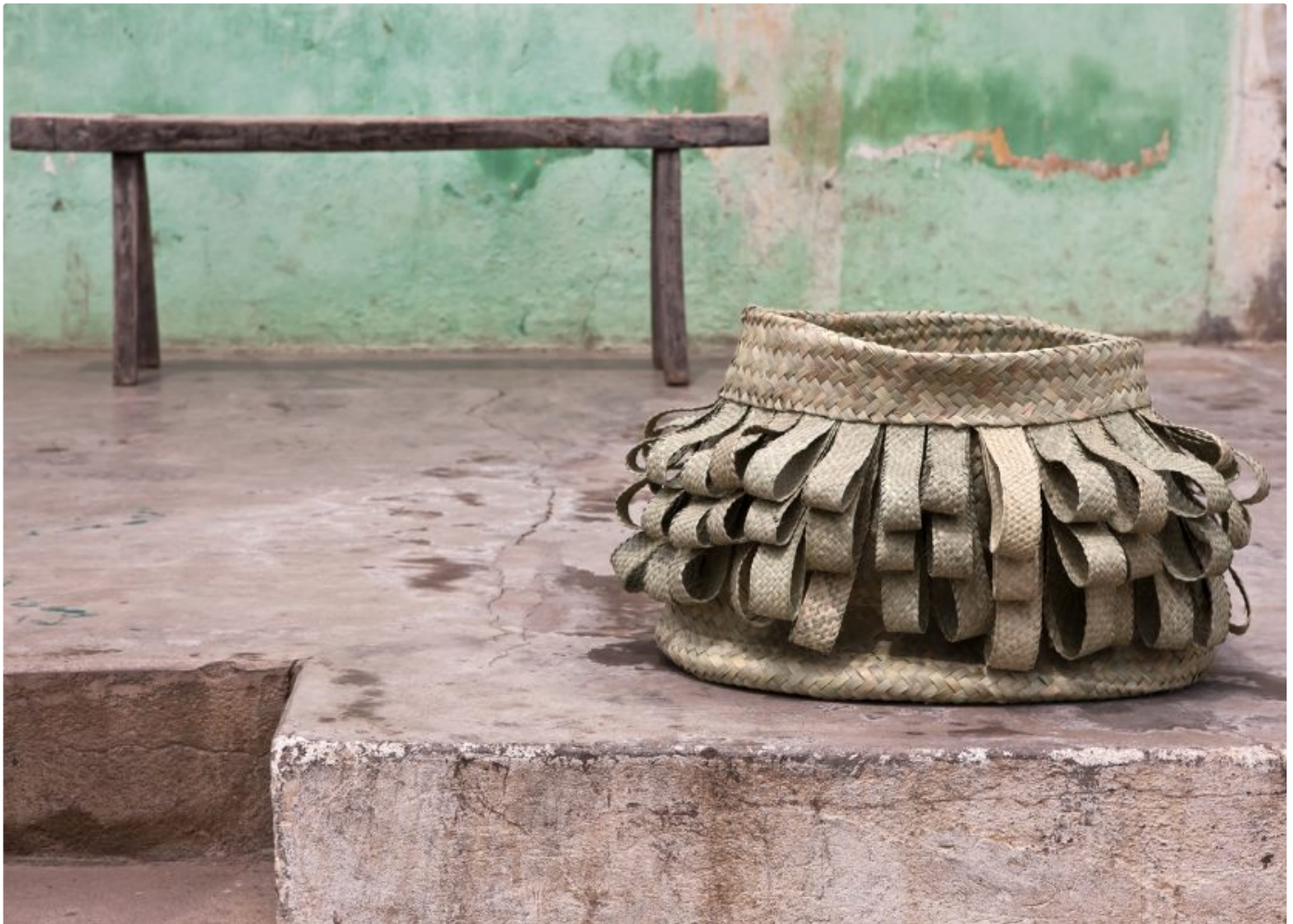
above > bogoió de argolas designed by marcelo rosenbaum

Nov 27, 2016 | bedroom dining room entertaining fabric furniture home >> lighting living room outdoor