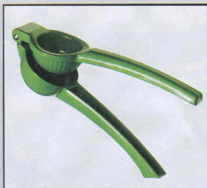
A lime squeezer perfect for making bracing caipirinhas. $10; ancohouseworks.com .