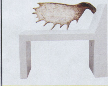
Made of white marble and a moose antler, the Rick Owens Tomb Stag bench can actually be a great low table. $80,000; salon94.com .