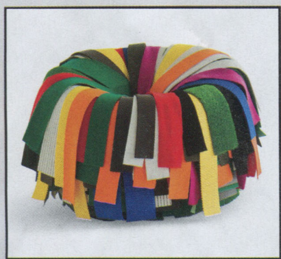
The surprisingly comfortable Sushi chair by Brazilian brothers Fernando and Humberto Campana. $5,280; ono.biz .