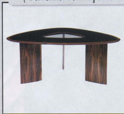
Joaquim Tenreiro designed this great dining table circa 1960. $800,000; r20thcentury.com .