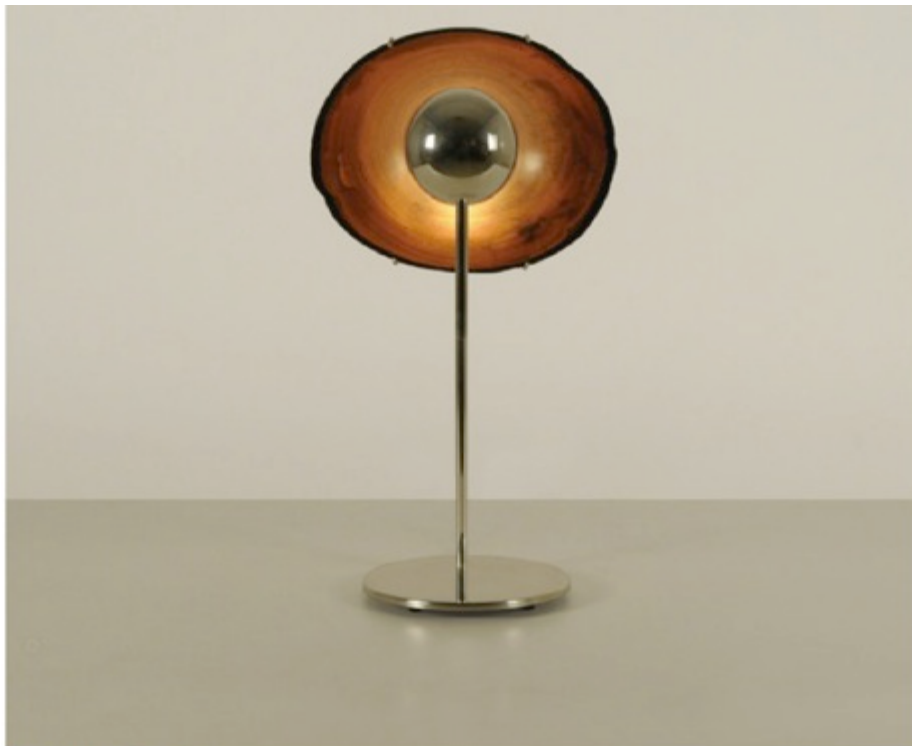
Arandela Cantante lamp