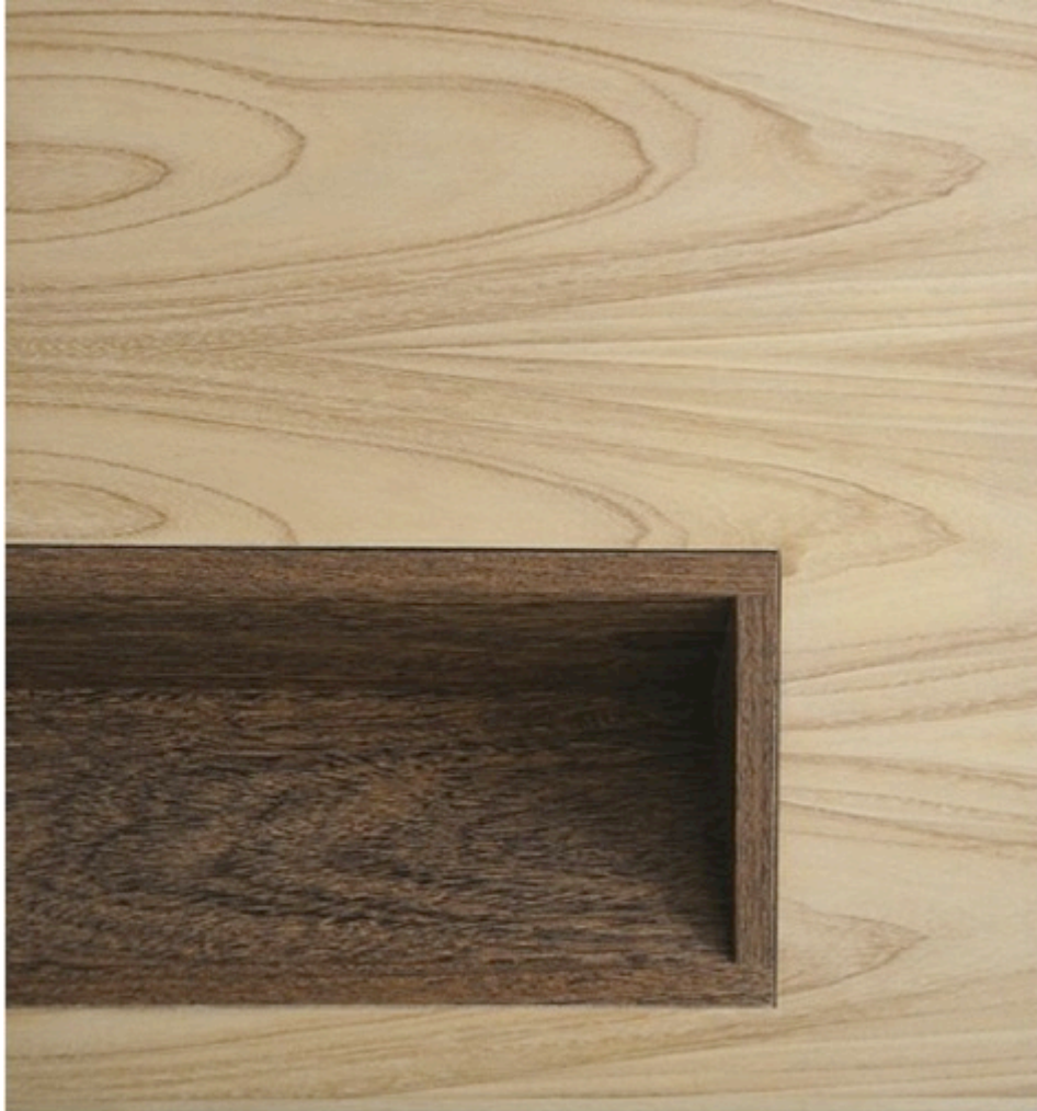
Pratica Desk detail

sources. I seek interesting textures and veins in wood and try to associate other materials to enhance its qualities and beauty. A reclaimed wood-floor, beams, or left over pieces, mixed with the smooth surfaces of concrete, limestone or metal.