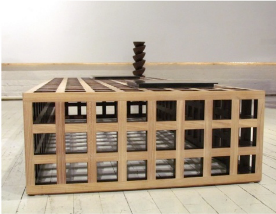
Cubo Libre coffee table