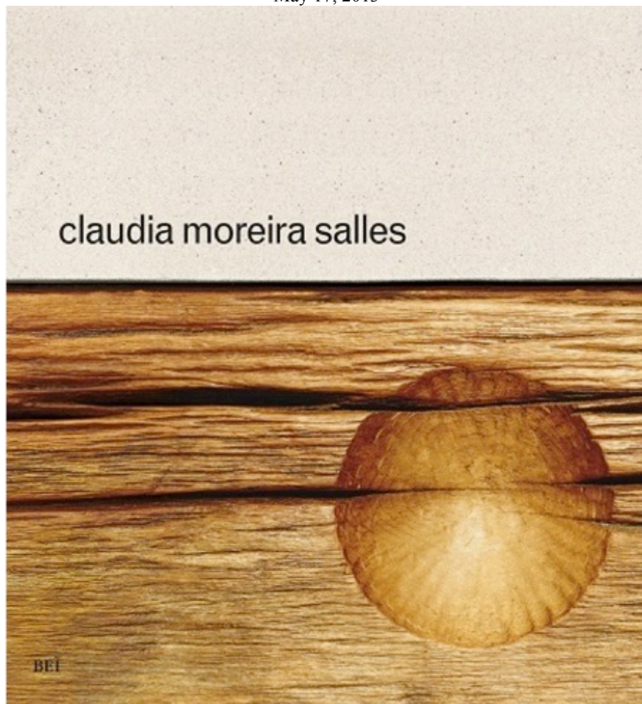
Book cover featuring Texturas table detail