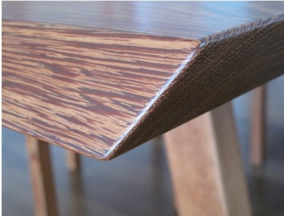
B1 table corner detail

My work is a product of the particularities of the production and market scenario of Brazil. Good crafts and abundant materials, especially wood, and an influence of our modernist masters like Niemeyer, Tenreiro and Sérgio Rodrigues.