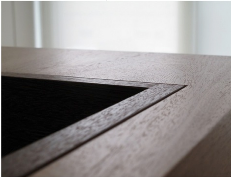
Pratica Desk wood detail