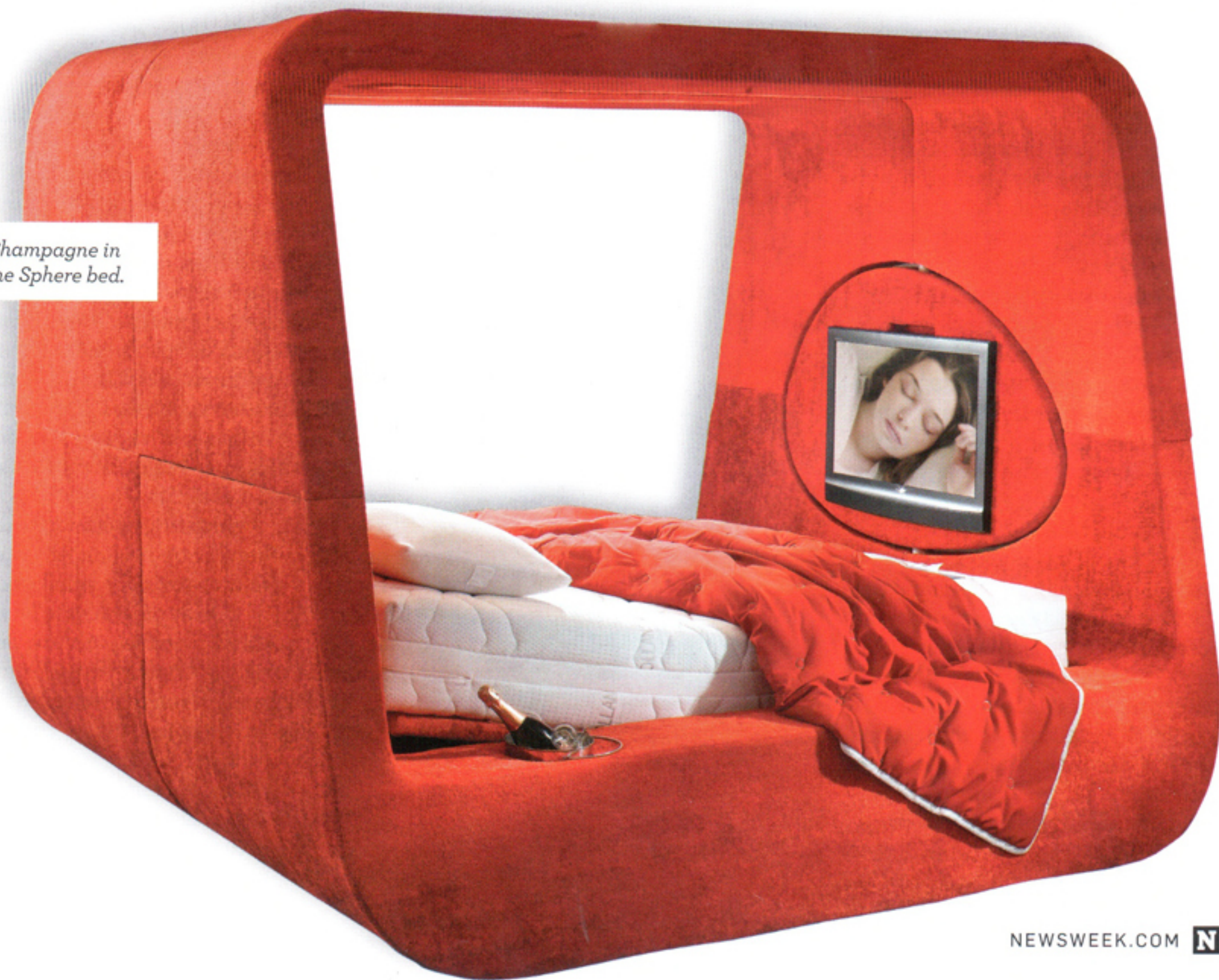
Champagne in the Sphere bed.

Less a piece of furniture than a high-tech, self-contained living space, the