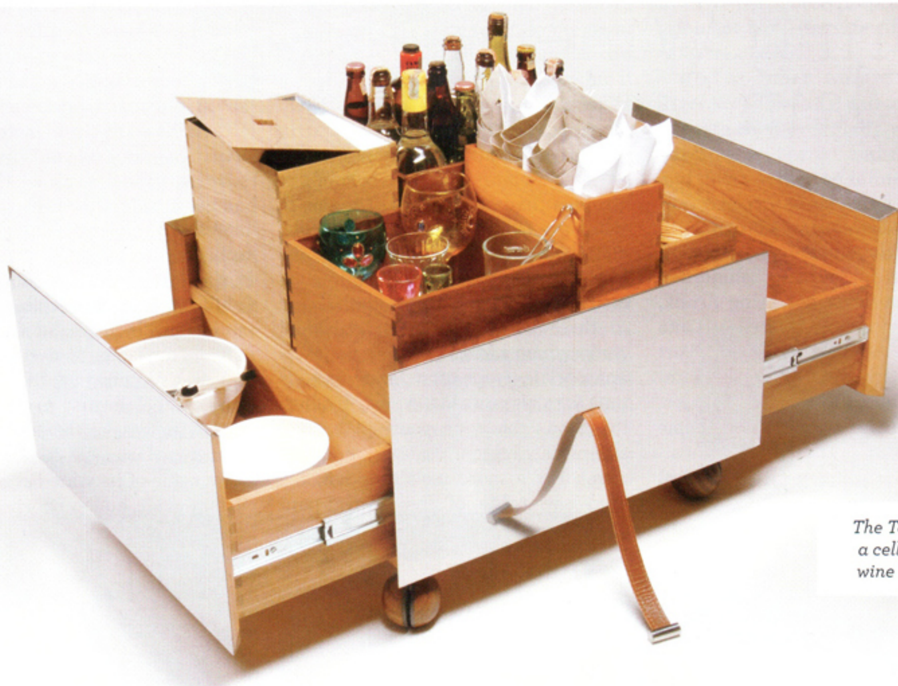
The Toto bar is like a cellar on wheels; wine cage (below).

Sphere bed, designed by Karim Rashid for Hollandia International, features LEDs in its canopy, an 81-centimeter television opposite the headboard, and a mattress with massage options. The presence of a built-in champagne cooler, made of stainless steel and embedded in the side rail, comes as no surprise ($50,000; hollandiainternational.com ).